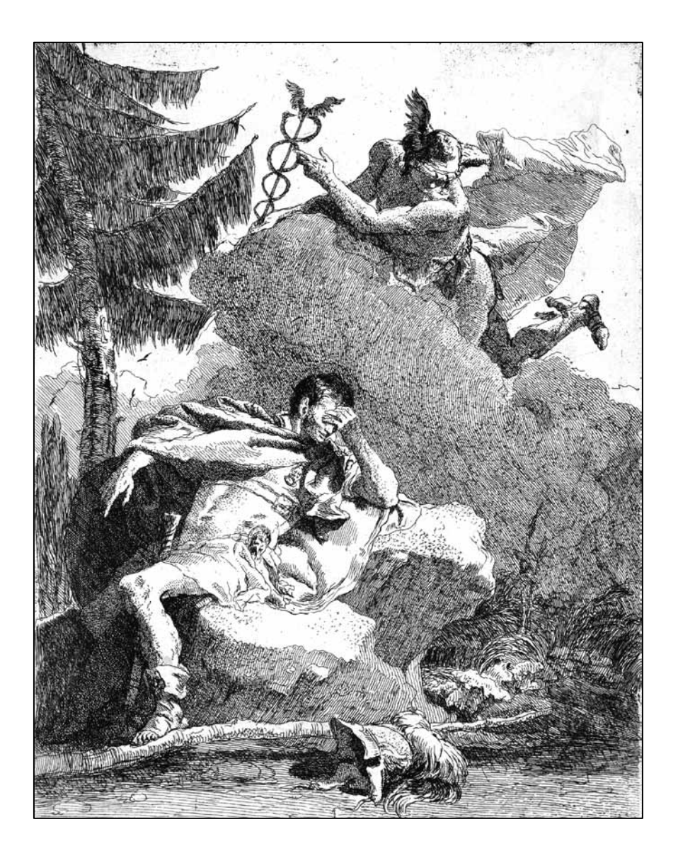
Mercury Appearing in a Dream to Aeneas Giovanni Domenico (Italy, 1727–1804) Yale University Art Gallery