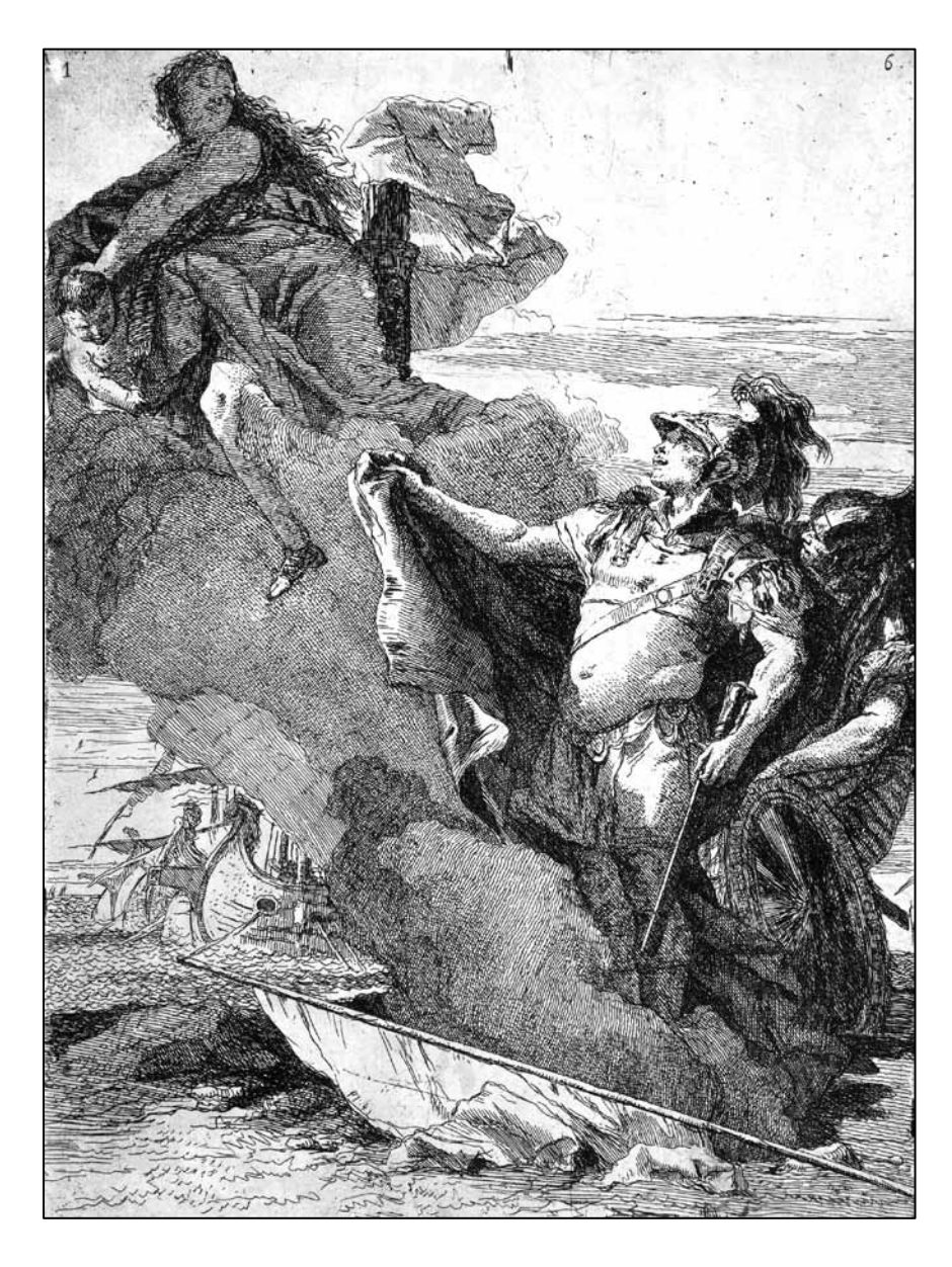
Aeneas Recognising Venus as She Disappears in a Cloud Giovanni Domenico Tiepolo (Italy, 1727–1804) Yale University Art Gallery